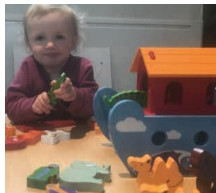
A new Noah's Ark has joined the toys

on floor or chairs by the end of the morning – what a superb lot of parental and team helpers! New life seemed to be an appropriate theme for the first session after Easter and the ‘choir’ joined in “If you’re happy and you know it, clap your hands” with gusto.