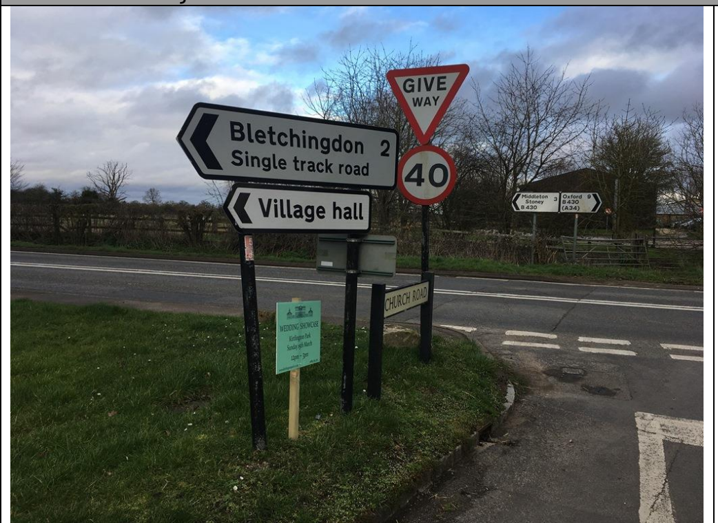
Location 4 B430 junction with Church Lane on island south-east side

Remove direction signs, HGVs sign and posts and dispose.